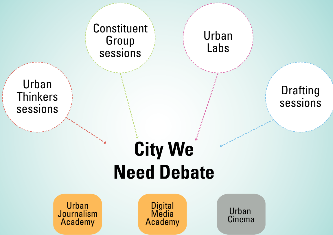
Figure 2: The Urban Thinkers Campus Model